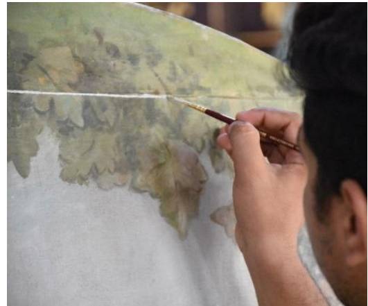
Infilling of losses