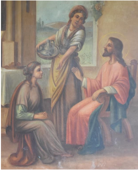
Painting before conservation