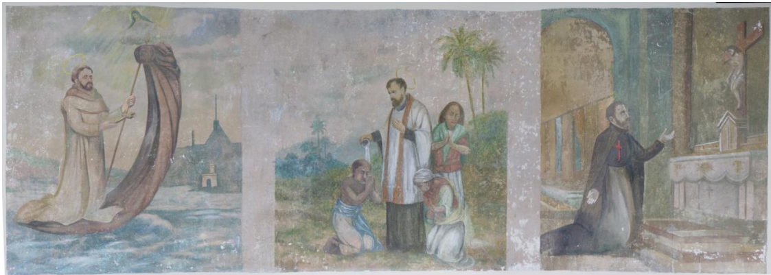
Wall painting before conservation