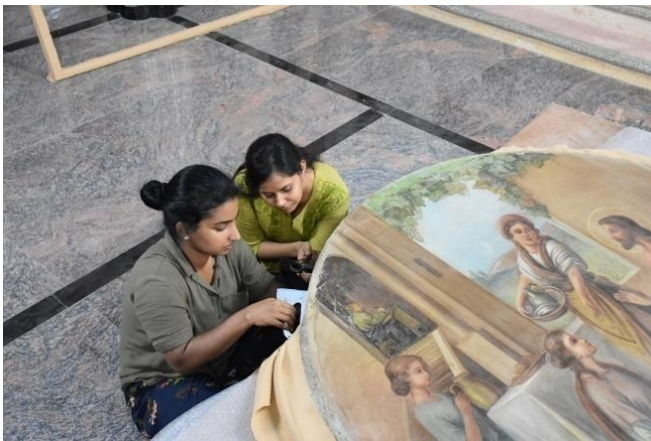
Re-stretching of the painting