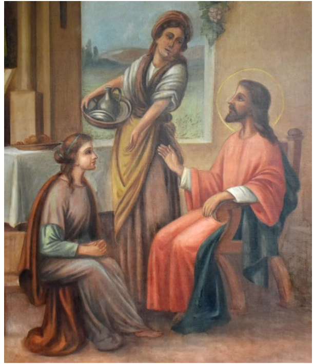
Painting after conservation