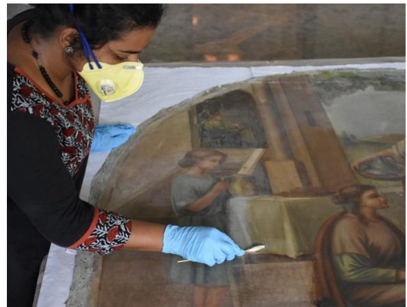
Cleaning of the Painting