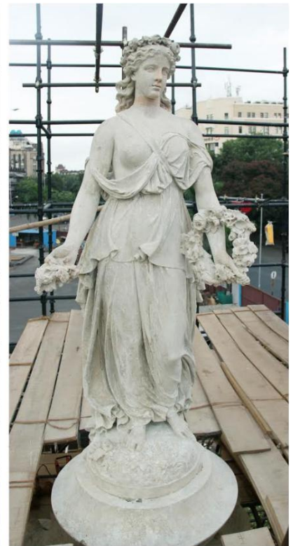
Flora sculpture before and after removal of layers of paint and other depositions