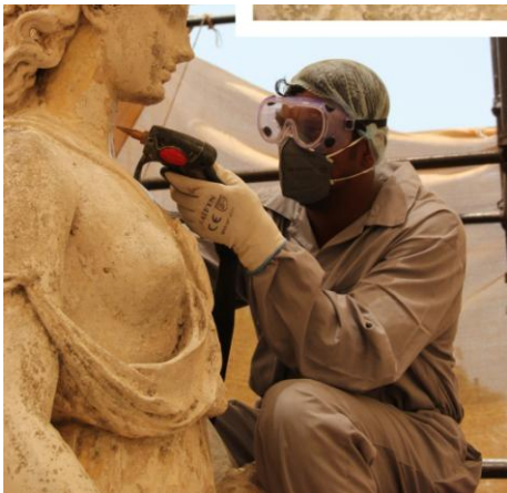
Removal of stubborn incrustations with micro chisel

The conservation work undertaken by the INTACH Conservation Institute team involved cleaning of entire fountain structure using steam machines to remove the multiple layers of deposition, removal of all previous improper unscientific cement plaster repairs and fillings. Algaecide treatment to arrest the biological growth as well as consolidation of stone. Further, filling and grouting of joints and gaps and reintegration of losses including fixing of carved hands and other loose, detached, broken parts was undertaken. The project was completed in December 2018.