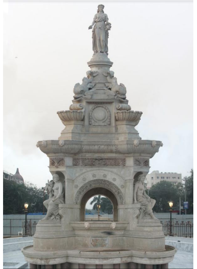
Flora fountain before and after removal of layers of paint and other depositions