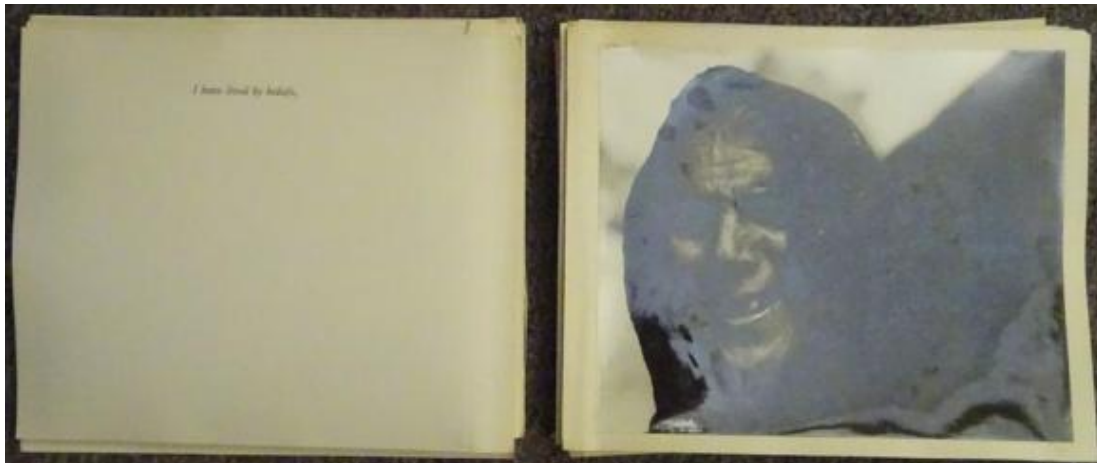
Photo of diploma document kept in polythene bag, stuck due to moisture, having loose stitching

Conservation of diploma documents of National Institute of Design, Ahmedabad: 43 diploma records were received for conservation at the Institute. All the diplomas were highly damaged and required conservation along with digitization and binding. They were fumigated before giving treatment. Objects were documented, dry cleaned and binding was removed. Each folios of diploma records were de-acidified and stains removed. Tears and holes were repaired, spine guarded, lined, samples of pieces & photographs were pasted as in previous format. Re-stitched the diplomas along with archival binding. Butter sheet was inserted for separation of sample and photographs. Original binding was restored and pasted on binding board as a cover.