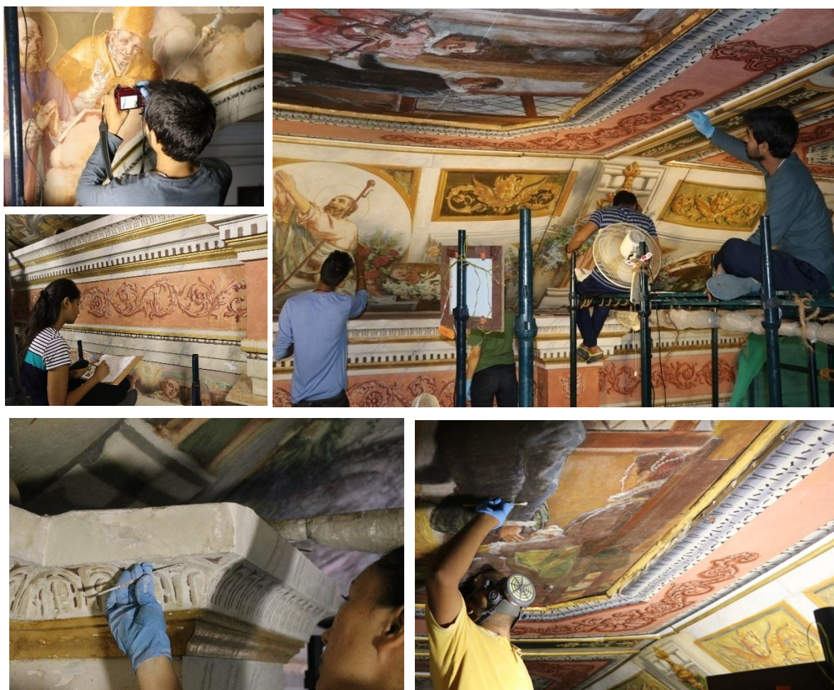
Conservation and restoration work in progress

The paintings were conserved scientifically by the INTACH Conservation Institute team working even at a height of approximately 50 feet (ceiling height). Some works weighing about 90 kg had to be brought down from the ceiling for conservation. The project started in November 2017 and finished in December 2018.