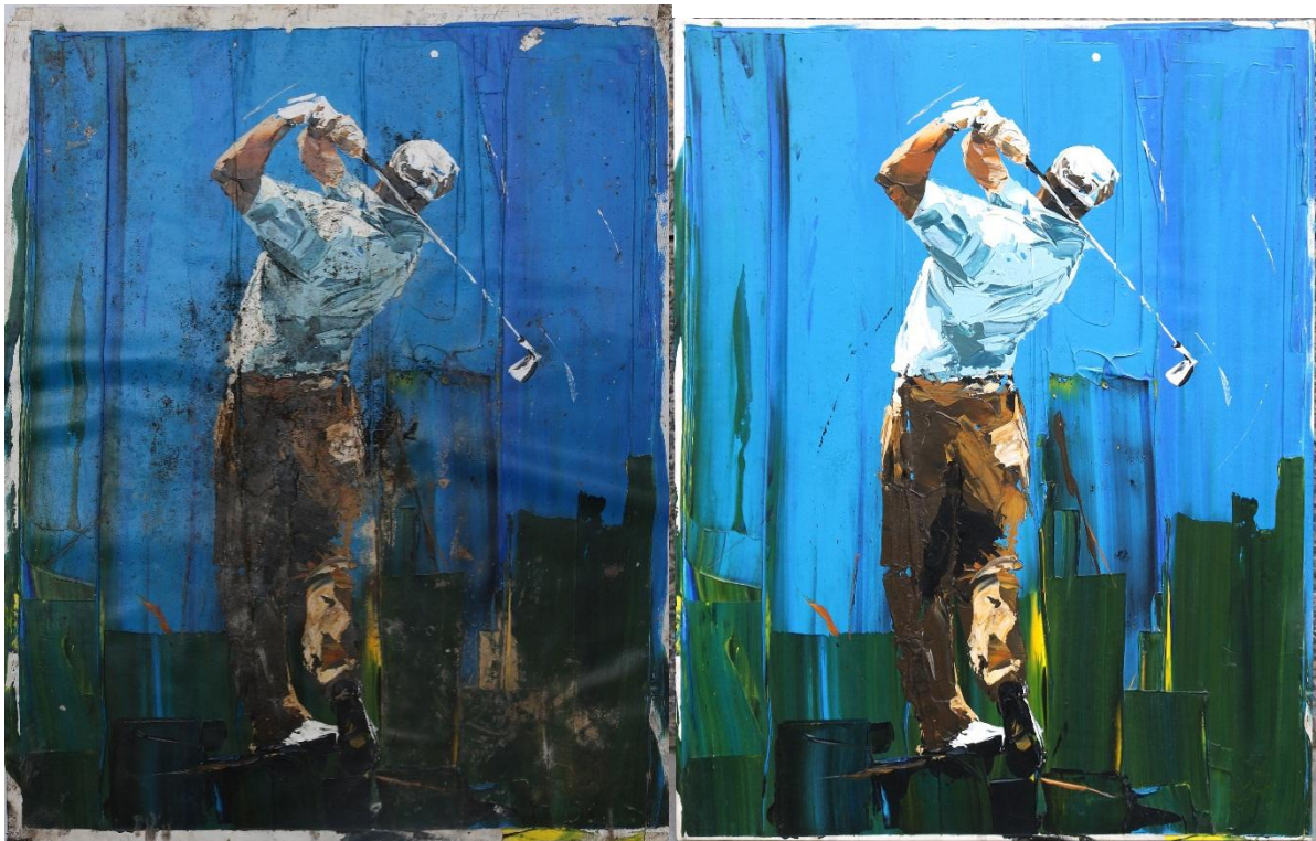
Thomas Easley painting (before and after conservation)